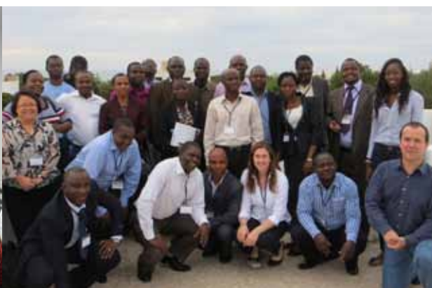
The third annual AGRODEP Members' Workshop, Dakar, Senegal, November 19-20, 2013