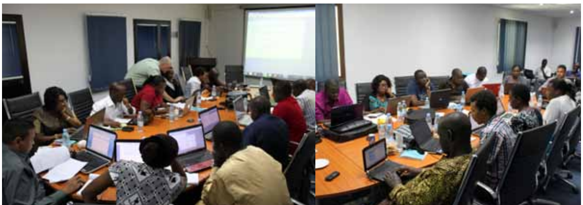
The fourth 2013 AGRODEP training course on Applied Panel Data Econometrics, Dakar, Senegal, September, 9-13

In 2014, IFPRI and its partners will focus on capacity strengthening and policy research through ReSAKSS and the AGRODEP Modeling Consortium. ReSAKSS will advance the establishment and strengthening of