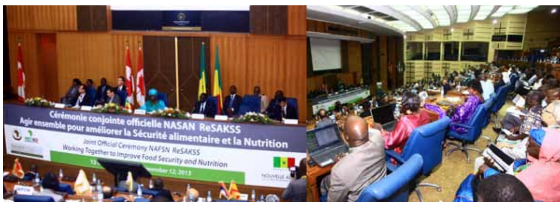
ReSAKSS Annual Conference, Dakar, Senegal, November 12-13, 2013