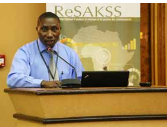
ReSAKSS Annual Conference, Dakar, Senegal, November 12-13, 2013